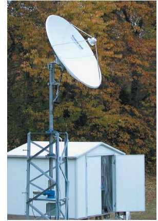
POES Tracking Dish