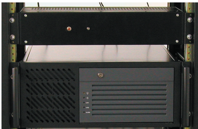
POES Station and Tracking Controller

The POES Box is a rackmount computer system (shown below, bottom unit) with an integrated digital Receiver Card. This box interfaces with a tracking controller (shown below, top unit) that controls the azimuth and elevation of a tracking dish (shown upper right corner of this page).