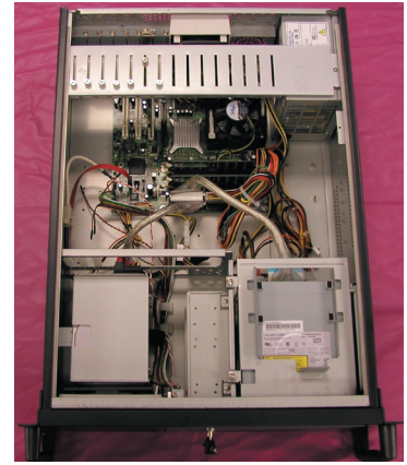
GOES Box Rackmount Version