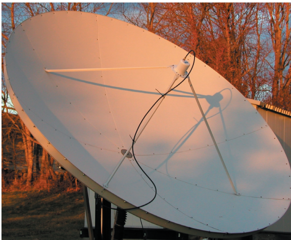
Typical GOES Dish with Integrated Feed

The GOES Box, along with a 10ft (3m) or larger dish, and an appropriate feed provides a complete system. The system automatically ingests and stores the data allowing meteorologists or students to make use of the data using a powerful and easy to use image processing tool.